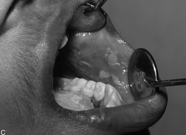
Figs 1A to C: (A) Ulcers on the labial muocsa; (B) Indentations on the tounge; (C) Ulcers on the left buccal mucosae

pemphigus.<sup>7,8</sup> However, especially in an adolescent, the possibility of pemphigus vulgaris, erythema multiforme, acute herpetic gingivostomatitis, and aphthous ulcers need to be considered.<sup>5</sup> In this case presented here due to lack of ulcer-free period the possibility of aphthous ulcers becomes less likely and further, as there are neither clinical features suggestive of infection nor immunodeficiency status acute herpatic gingivostomatitis can also be excluded.<sup>5</sup> The possibility of epidermolysisbullosa, cicatricial pemphigoid, bullous pemphigoid, and paraneoplastic pemphigus conditions was not taken into consideration as the clinical features were not very suggestive. Therefore, the clinical features were more in favor of a vesiculobullous disease.